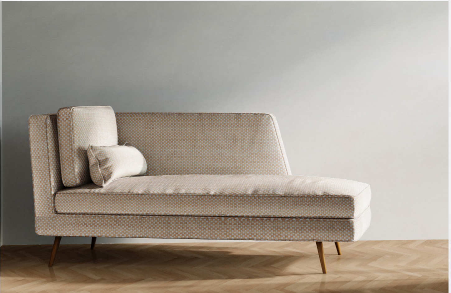
Oxford | Bone & Honey

A fine woven leather fabric that can be dressed up or dressed down. Create a landscape of color mixtures or keep it simple as a solid. Either way this design adds a refined look to any piece.