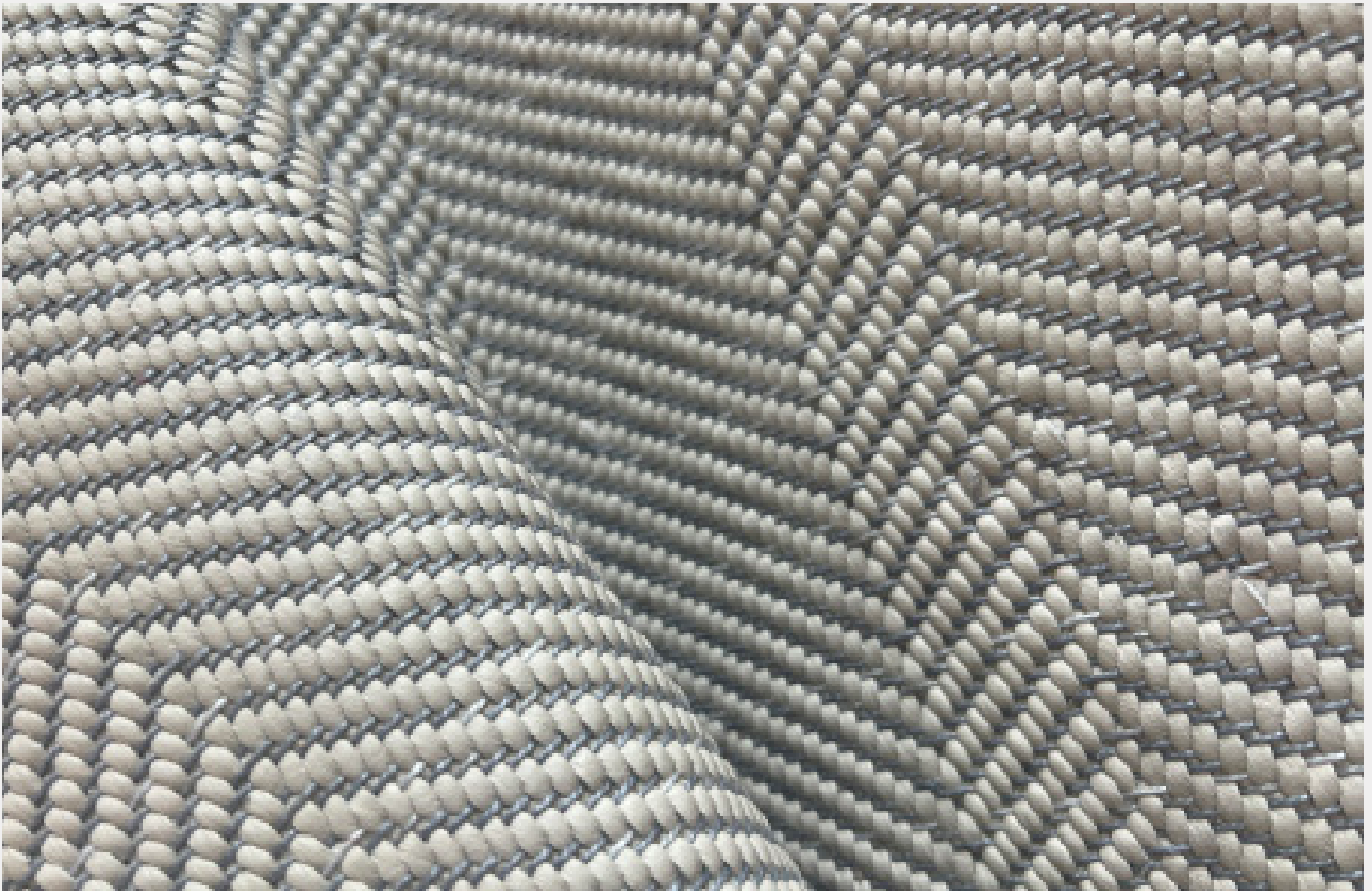
Herringbone | Bone Grey

Our herringbone weave is classic and refined. It is woven with a fishbone pattern to have a sultry drape.