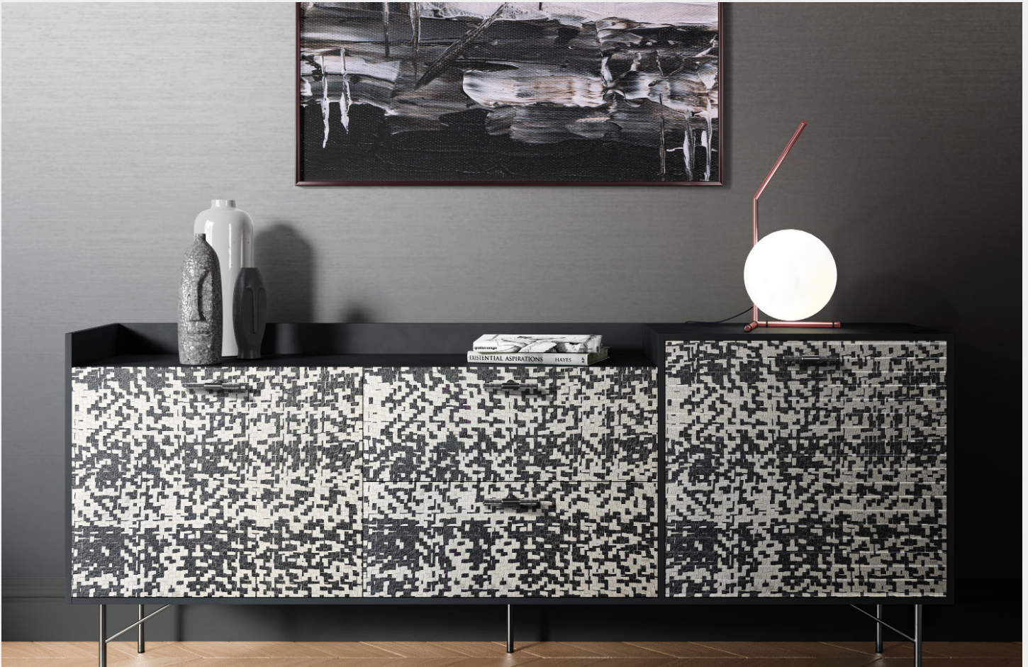
Basket | Black & White

Carefully woven strands of leather, over and under each other to create a lusciously soft surface with a center focal point.