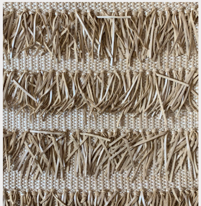
Plume | Natural

Woven leather upholstery is a fresh way to transform your space through material, pattern and color. Reinvent your favorite chair or create statement pieces for each room from scratch. All of our woven upholstery is made by hand in the USA and suitable for residential and commercial spaces.