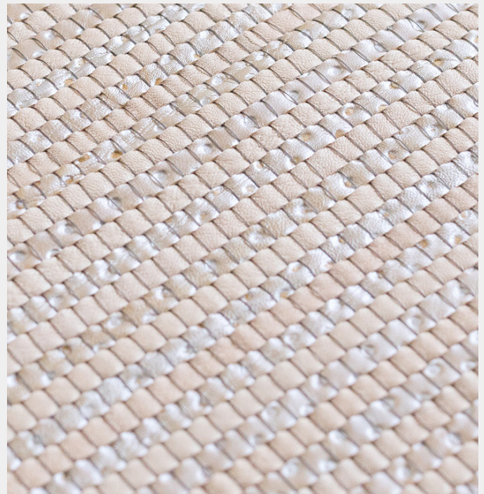
Mica | Frosted Honey

Woven leather upholstery is a fresh way to transform your space through material, pattern and color. Reinvent your favorite chair or create statement pieces for each room from scratch. All of our woven upholstery is made by hand in the USA and suitable for residential and commercial spaces.